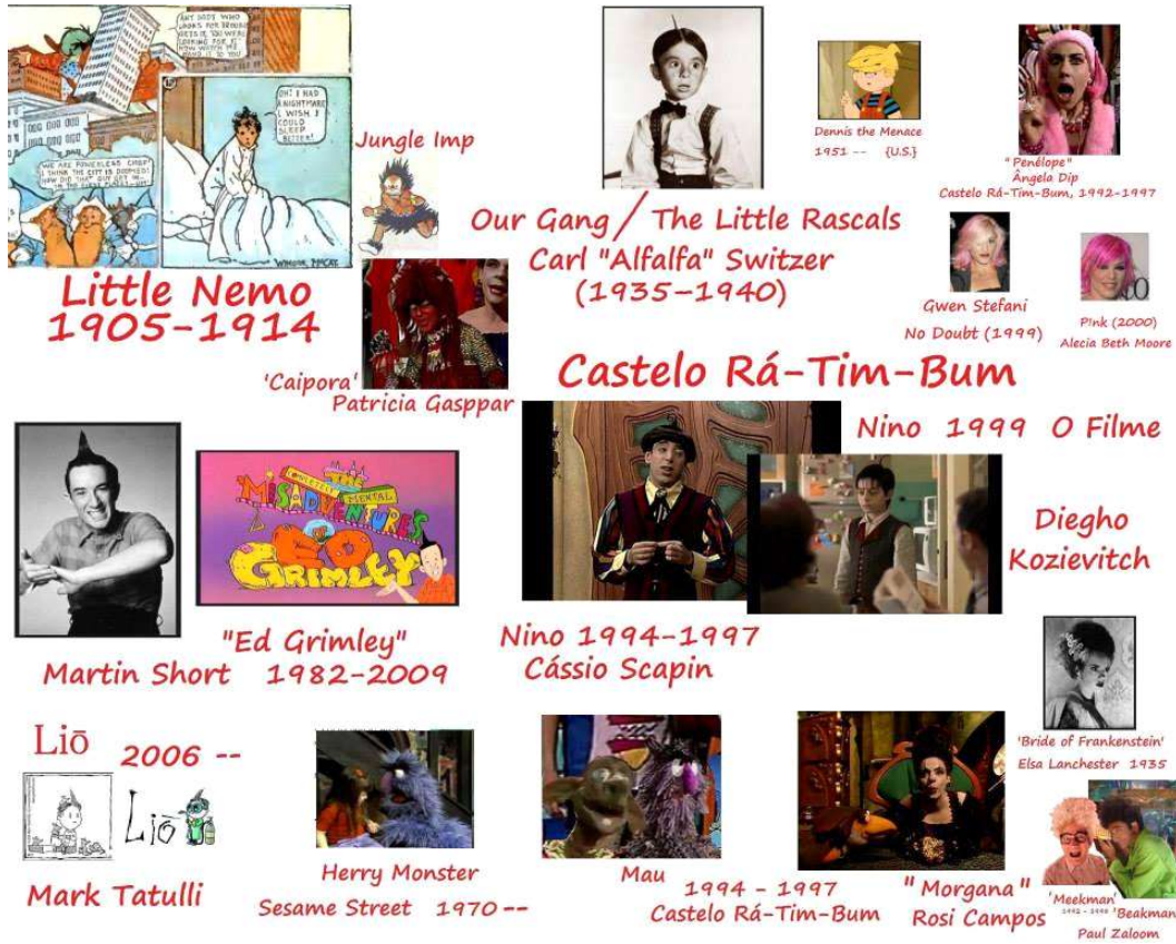
Originally posted in "Castelo Rá-Tim-Bum, Entusiastas" on March 20, 2015.